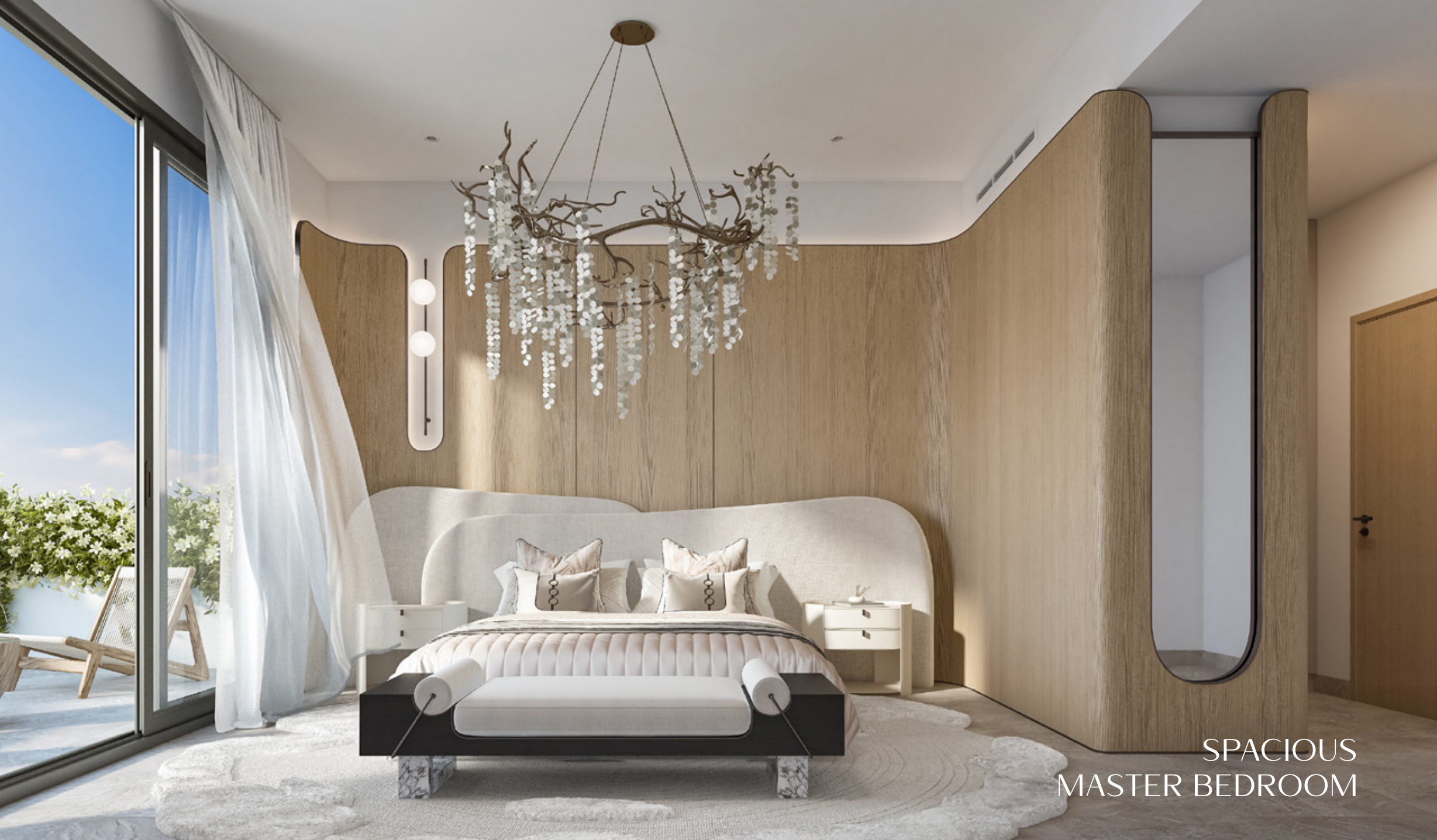
SPACIOUS MASTER BEDROOM