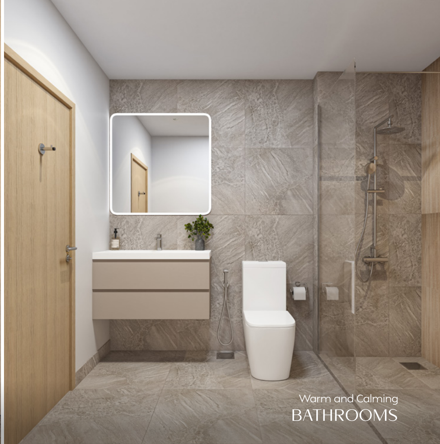
Warm and Calming BATHROOMS