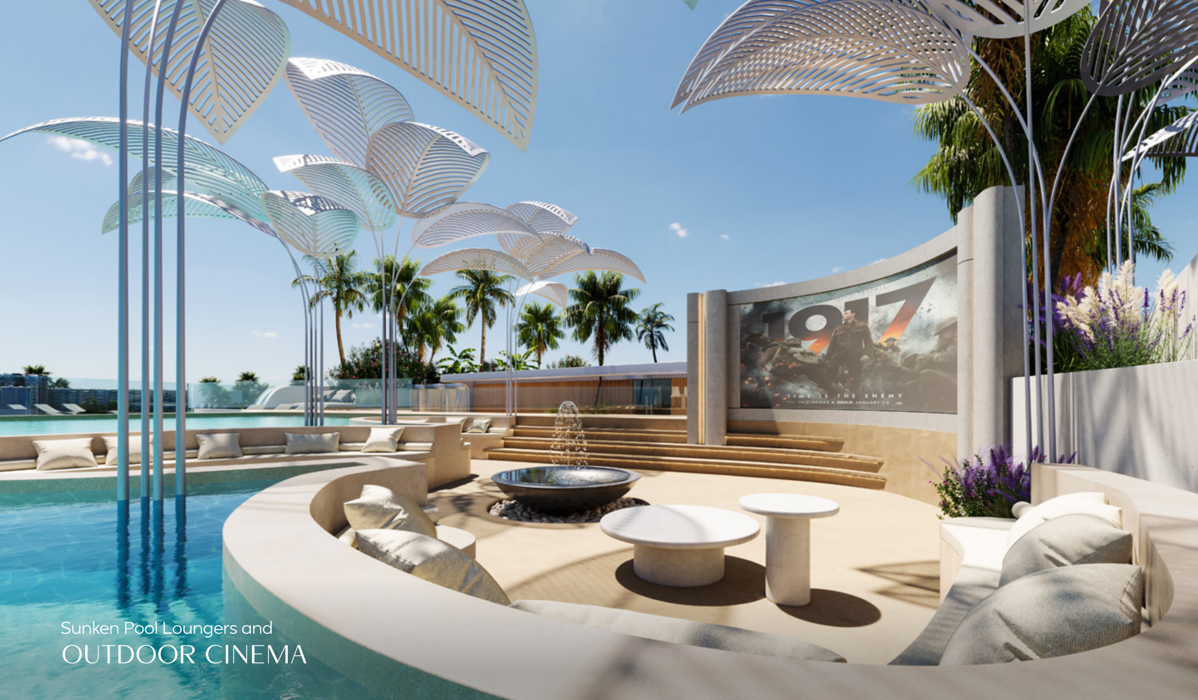
Sunken Pool Loungers and OUTDOOR CINEMA