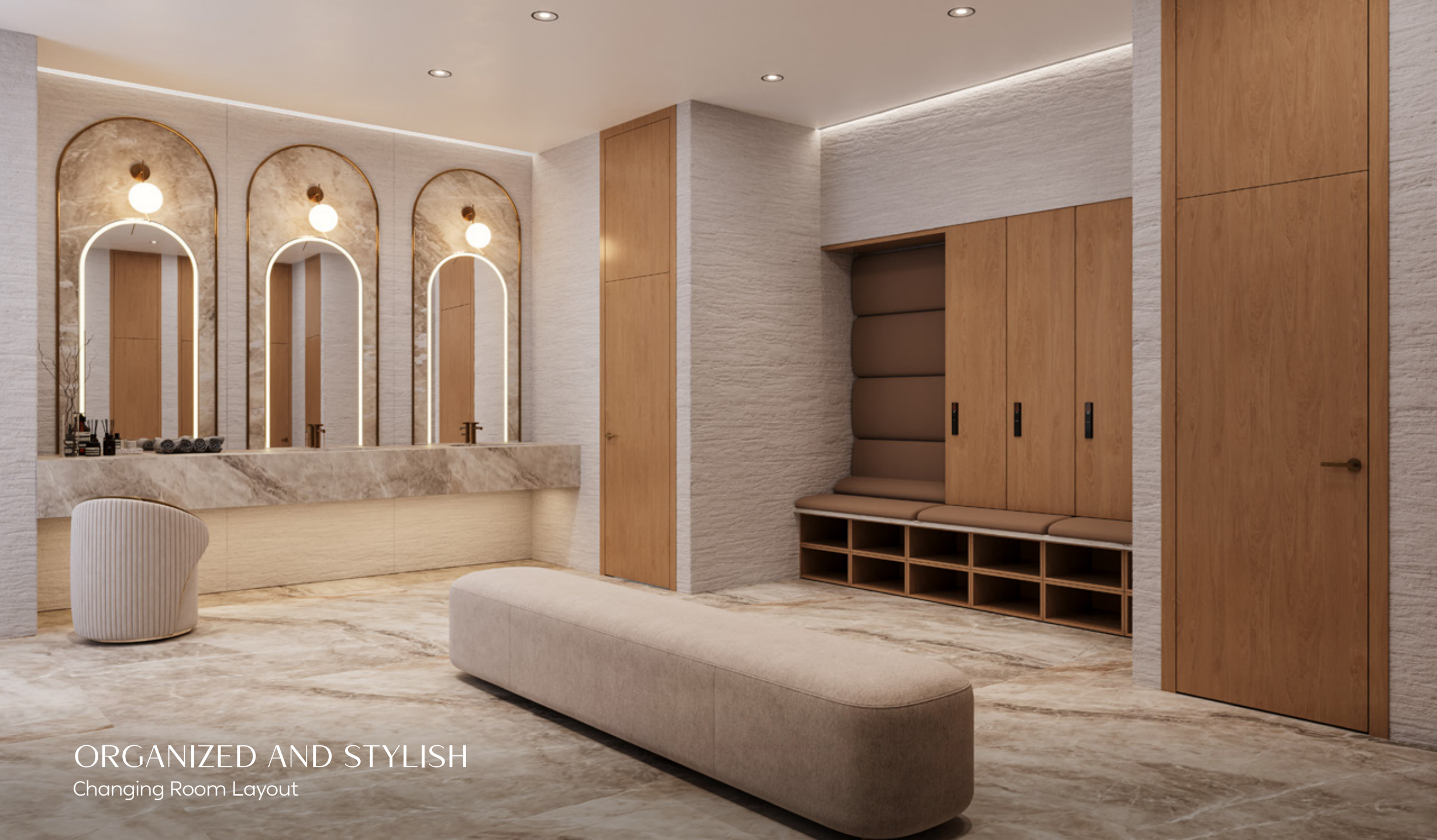
ORGANIZED AND STYLISH Changing Room Layout