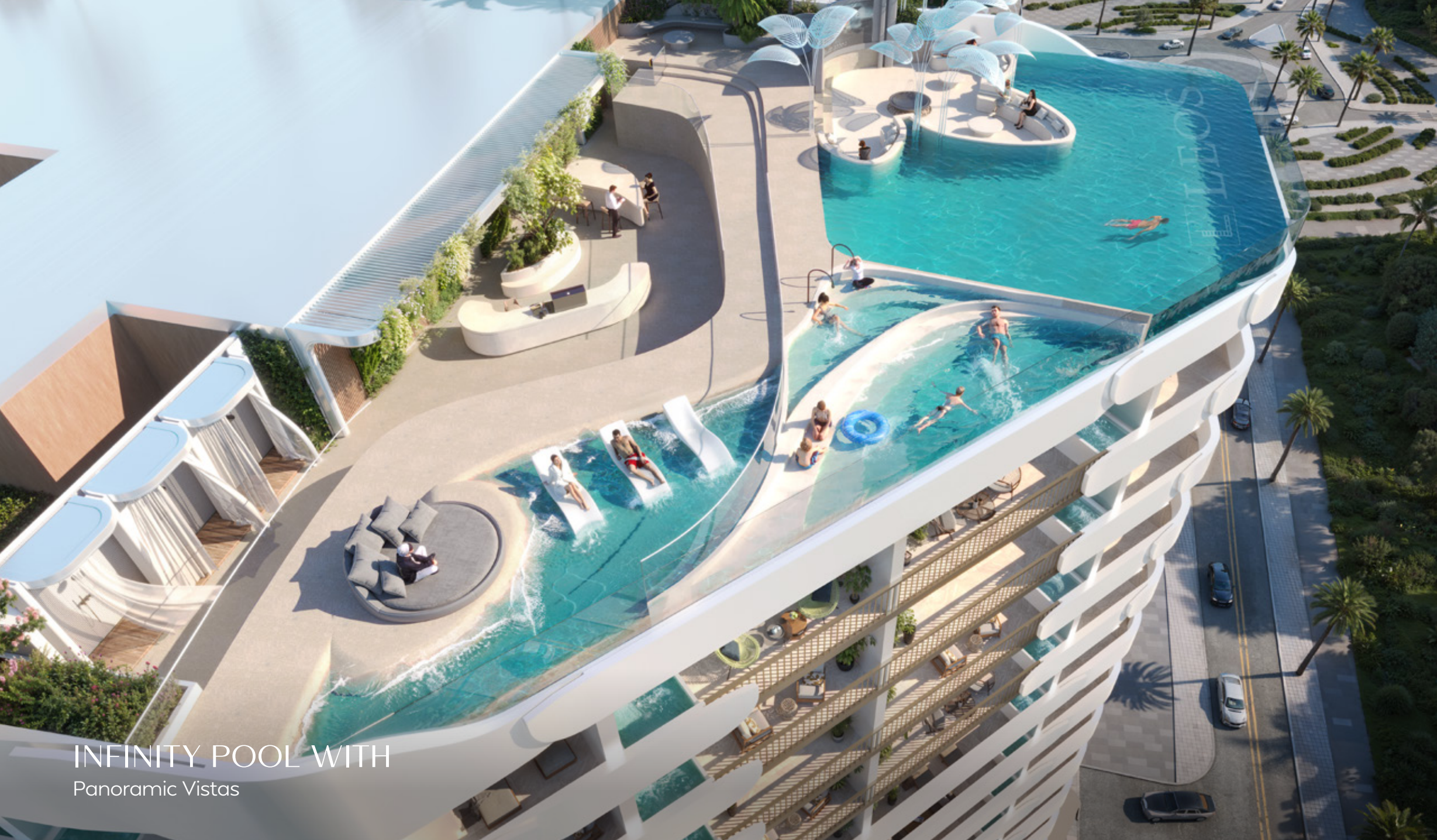
INFINITY POOL WITH Panoramic Vistas