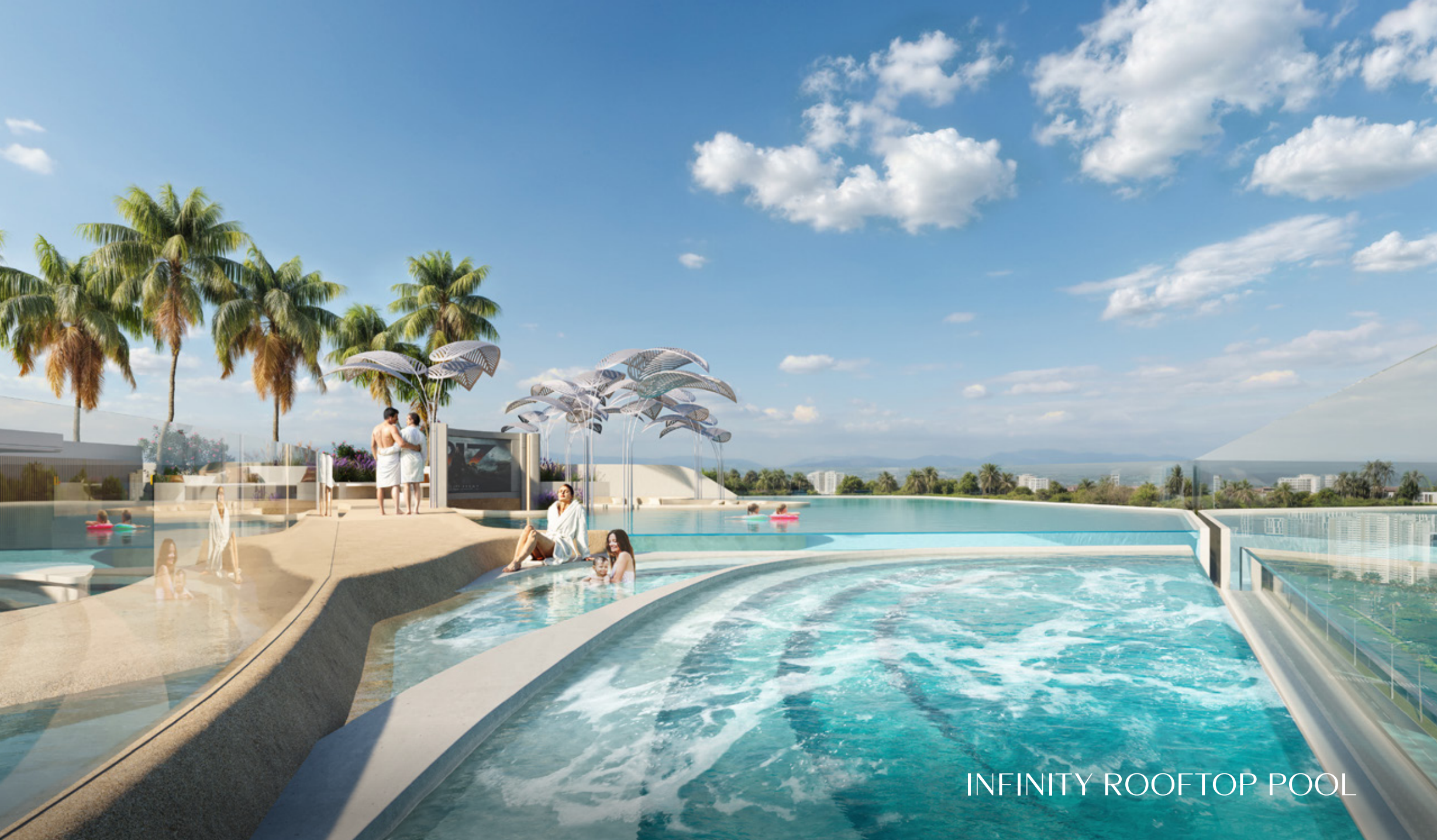
INFINITY ROOFTOP POOL