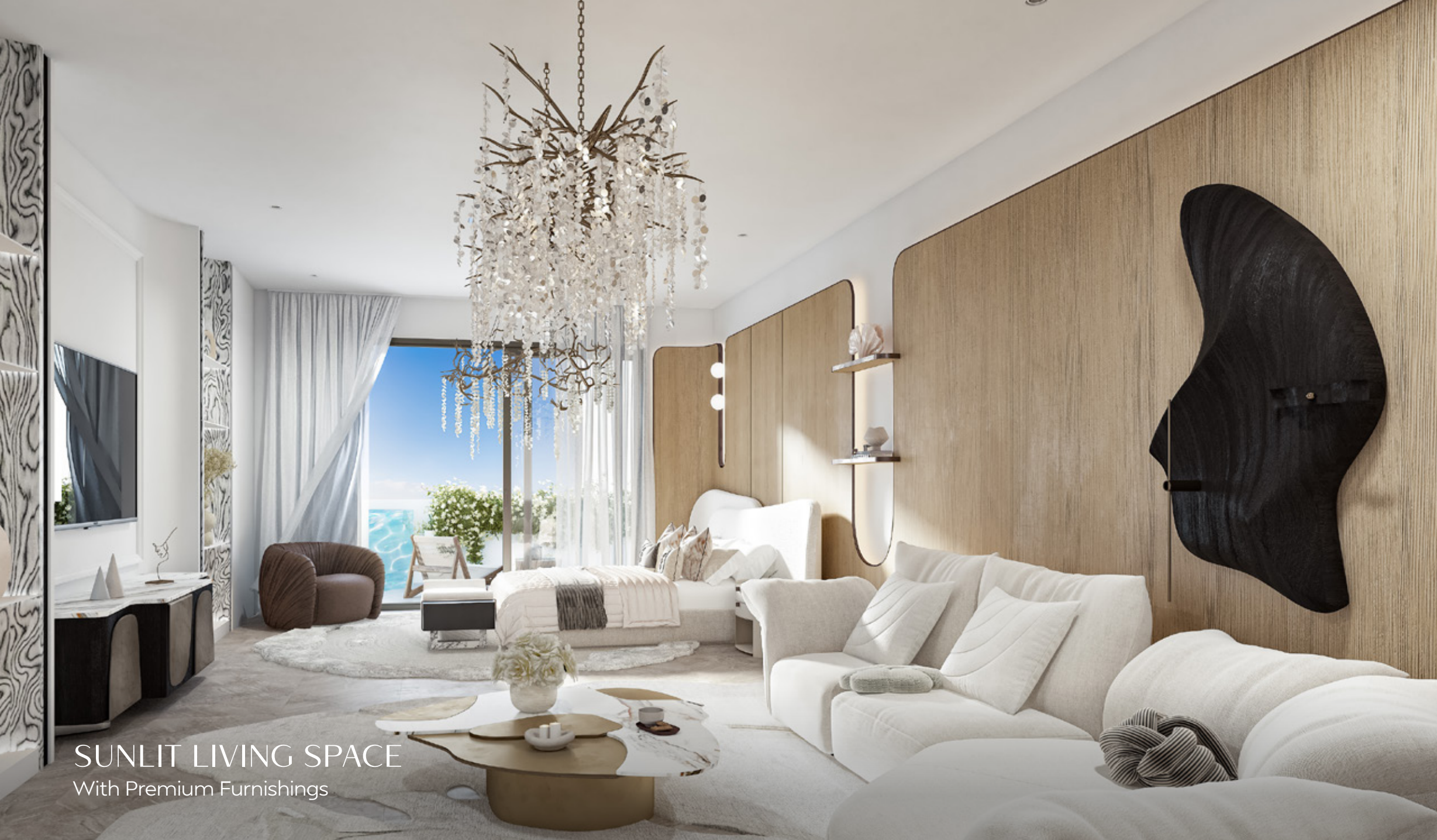
SUNLIT LIVING SPACE With Premium Furnishings