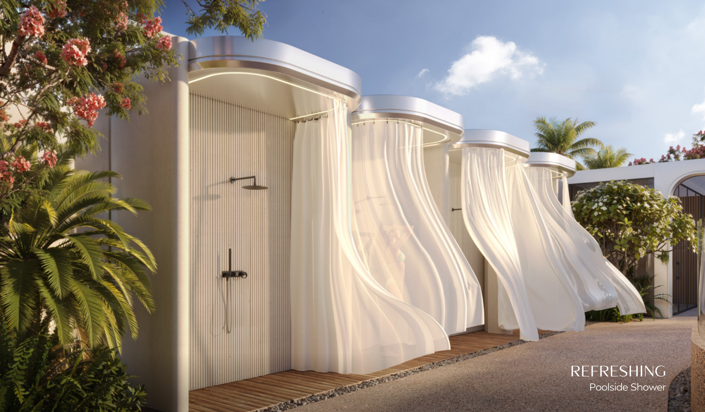
REFRESHING Poolside Shower